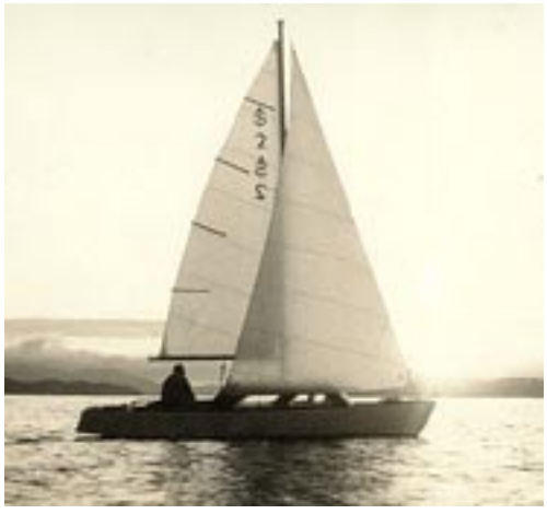
Sunrise discovery of the Bay of Islands in my Spencer 25' Stiletto 'Baccara' 1967

John's only remaining ambition was "to see as many people as possible, especially children, afloat in their own boats"