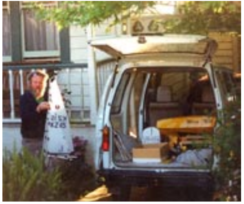
One Metre Radio Yacht World Technical Officer

Hard to clean up . I had sent up the results of some 'pull out tests' I had carried out on self tapping screws after doubting his advice, "Your tests on screws are nothing new to me..."