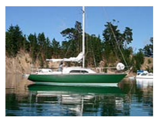
My own Spencer 30 'Julius Pleazar' from 1972. With tumblehome and 10'-2" beam no-one these days knows what it is, "What sort of boat is that?"

And then later, "Social Welfare Dept informed me today that my first "Guaranteed" Retirement Income will be deposited in my bank account tomorrow and henceforth every 2nd Tuesday. I bought after much hesitation this afternoon, a plastic bottle of $19.50 gin to celebrate. It is as good as any other London Dry but had one and decided I had lost my taste for it. I guess it's all just habit but why can't I get a habit for fruit juice?"