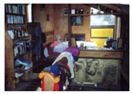
The ply clad pole house with a difference in the Bay of Islands featured a unique ventilation system and a Tanekaha tree growing up through a hole in the veranda!

Couldn't get on with other people's gadgets, for example his new crockpot, "I read the instructions fully and did what they said. Set it going in expectation of having my first meal from it around 7 hours later at which stage the vegetables were still raw. Left it overnight and the vegetables were still raw though the outside of the pot was hot. Turned it onto high and got in with a potato masher (not needed in the instructions) and finally after 28 hours I got it all cooked." He must have been getting peckish by then!