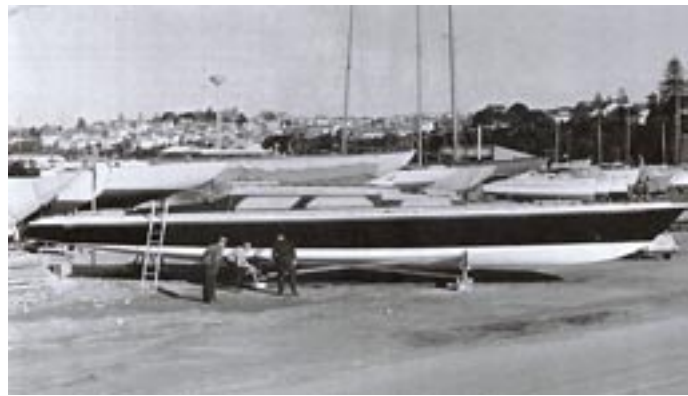
'Infidel' The 62' revolution in keelboat design, all other keelboats were obsolete overnight!

And more recently "I have suffered all my life from heating systems that burn up oxygen and leave me short of breath. It is easy to keep warm with suitable clothes and I would have been dead 15 years back if I had followed up on Green Lane Asthma Clinic treatment for it. The fellow who they reckoned was their "Prize Patient" and did all they told him has been dead for 15 years now and was 10 years younger than me.