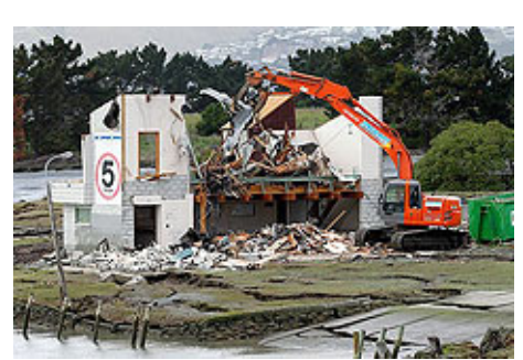
Mega 'Ouch!' at PPYC in Christchurch NZ