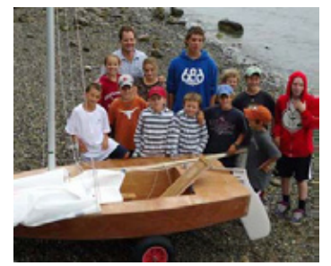
Keen crowd at the launch in Boston, Maine.