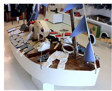
Handy clothes rack in trendy shop!

I spotted this old P Class being used as a clothes horse in a trendy Ponsonby children's clothing shop and thought it very funny! The P is NZs unique race trainer for kids. The boat is expensive and difficult to sail but that's it's strength - if you can sail a P well you can sail anything! Race fleets attract a large following of 'P Class Dads' shouting from coach boats.