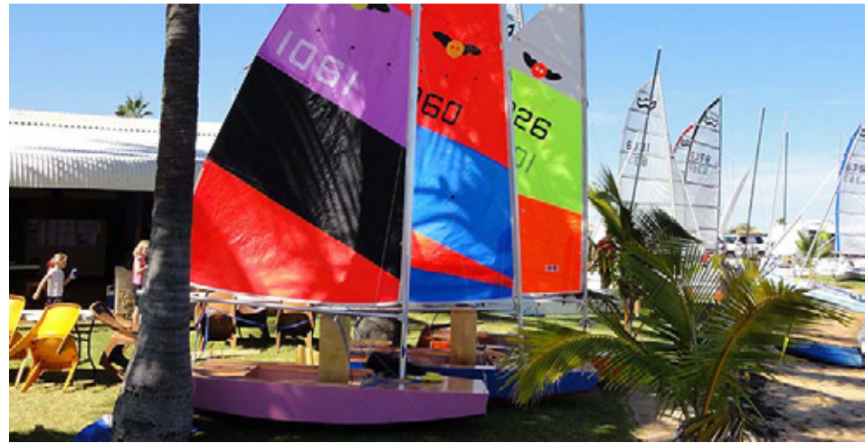
FireBugs take their place on the beach at the Carnarvon Yacht Club in tropical Western Australia