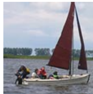
Small charter boats.