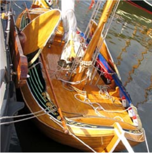
An extraordinary workmanship and maritime artistry.