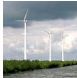
All types on the waterways but only electric windmills!