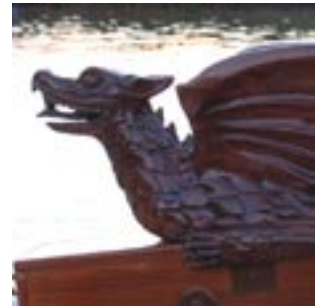
Grou all dressed up and a rudder carving for a Queen!

I walked the length of the waterfront looking for the 'one with the big orange banner' but soon resorted to a phone call and Koos appeared from the crowds. I had sailed in this area previously and seen plenty of the old ships around but hadn't ever been on board one. Our 'Ouwe Tukker' was a 32 footer in steel with the standard wooden spars, brown sails, lee boards, bent gaff, loose footed main and even a lead light window! There wasn't much that was familiar or 'normal'!