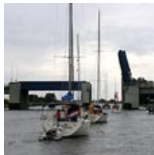
Heading off home.