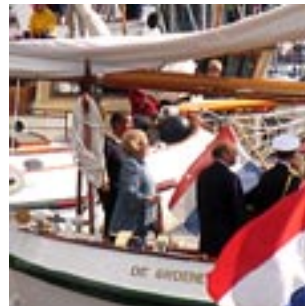
Real Queen at the helm.